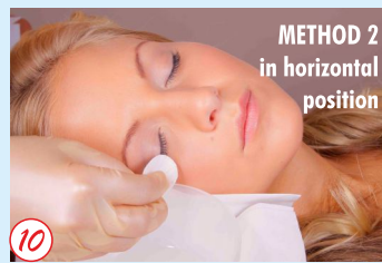
METHOD 2 in horizontal position

Take off the Skin Protection Pad carefully and wipe everything again with a moist cotton pad until all tint rests are removed.