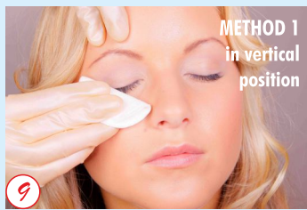
METHOD 1 in vertical position

Wipe any remaining tint thoroughly several times from the eyelashes by using moistened cotton pads.